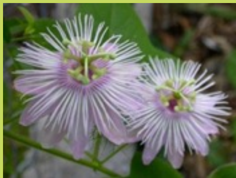
Passionflower, Scarlet fruit